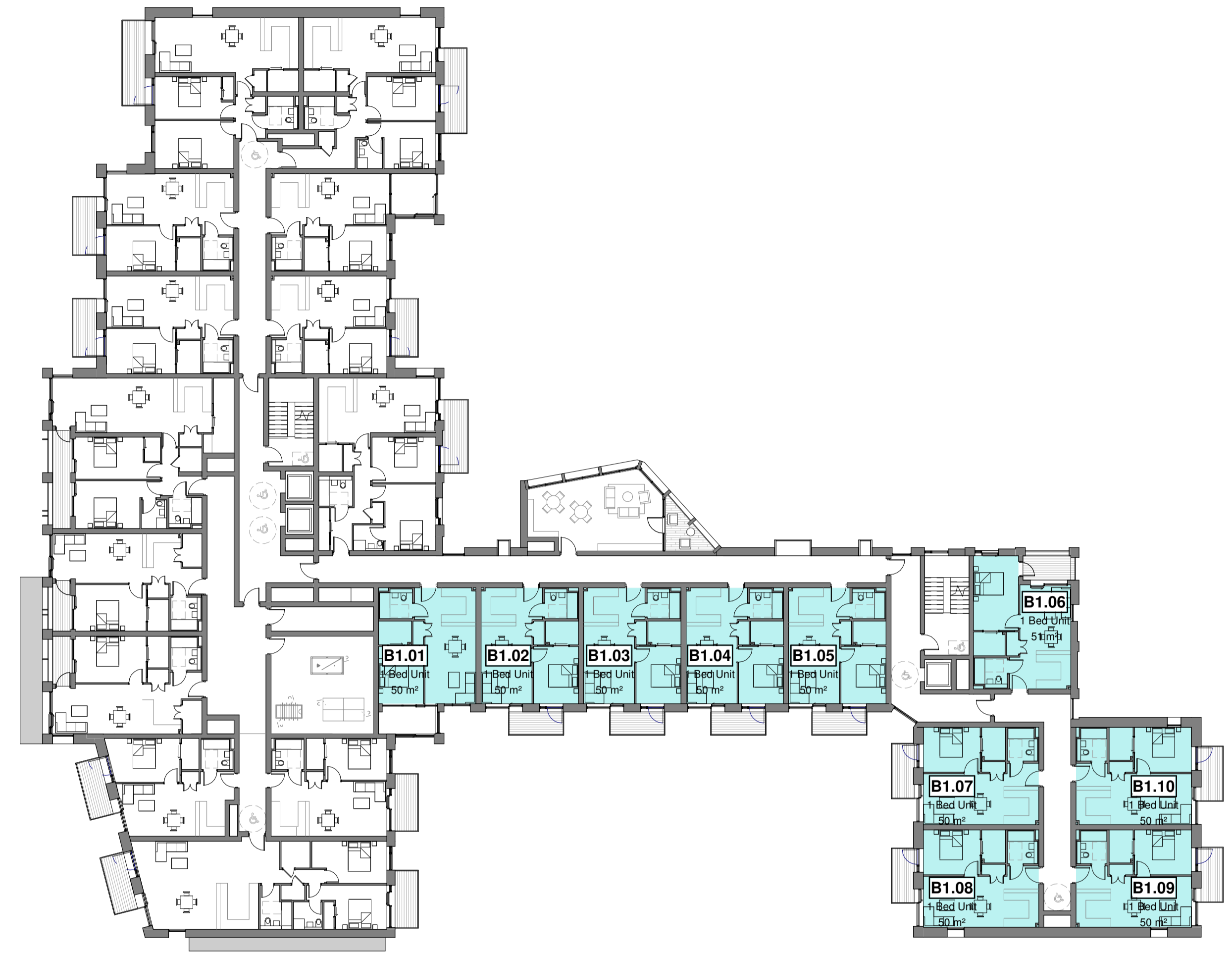
2 Level 01_Part V scale1 : 250