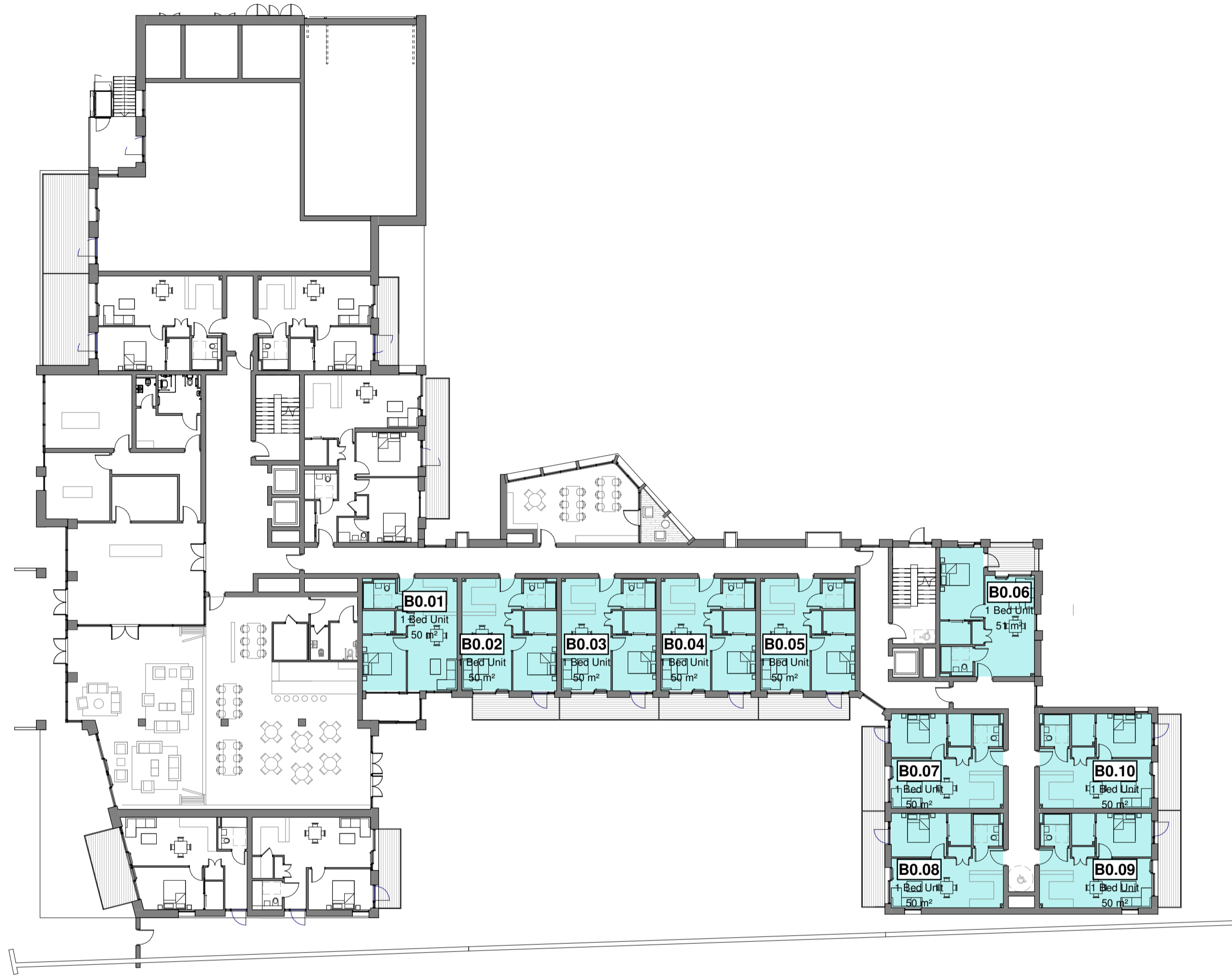
1 Ground Floor_Part V scale1 : 250